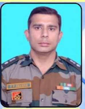
Lieutenant Col. Vineet Vasudev Indian Army