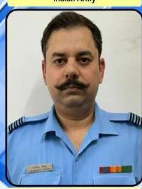
Wing Commander Sandeep Singh Indian Air Force